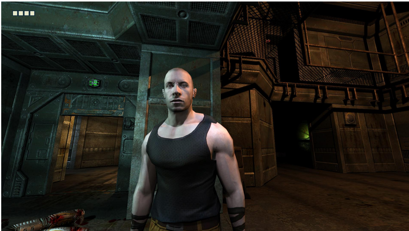
Chronicles Of Riddick Dark Athena Activation Crack